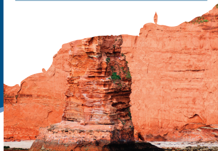
Ladram Bay, East Devon