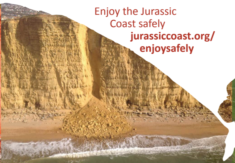
East Cliff, West Bay, Dorset.